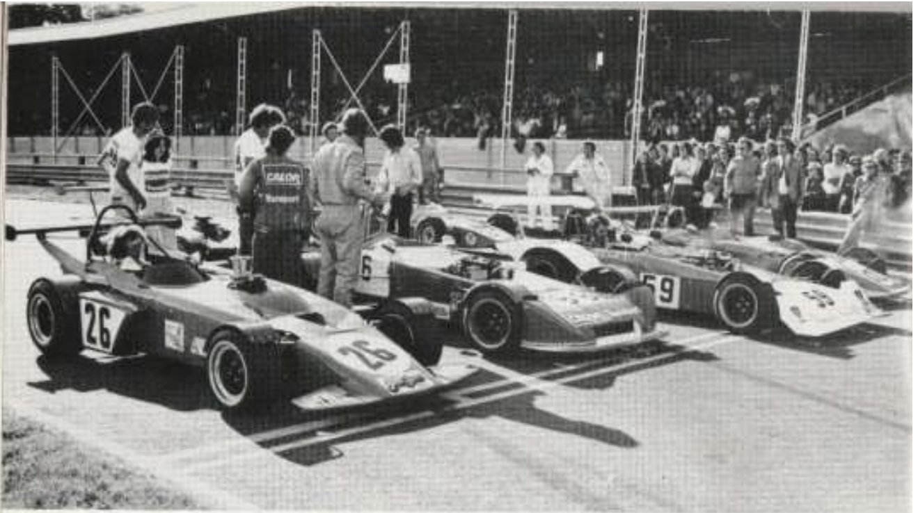
The Clubmans boys line up for their Trophies—Ingliston, July 1975

80 67 70 64 63 63 68 79 75 99 96 98 97 12-97 13-95 14-98 11-99